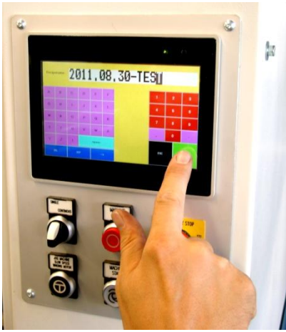
Color touch panel