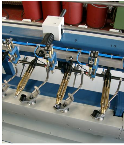
Winding mandrels and flyers